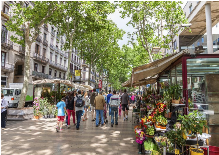
Las Ramblas, the gorgeous promenade in the old city of Barcelona.