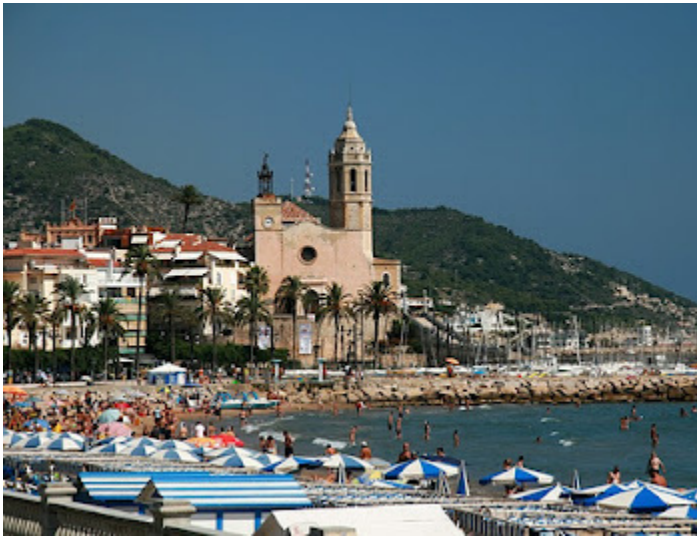
“La Punta” is Sitges’ distinctive church, with its picturesque spire that appears in most postcards.