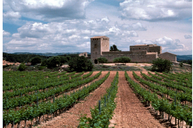
A VISIT TO OUR 12th-CENTURY CASTLE OF MILMANDA AND VINEYARDS IS ALSO IN THE ITINERARY