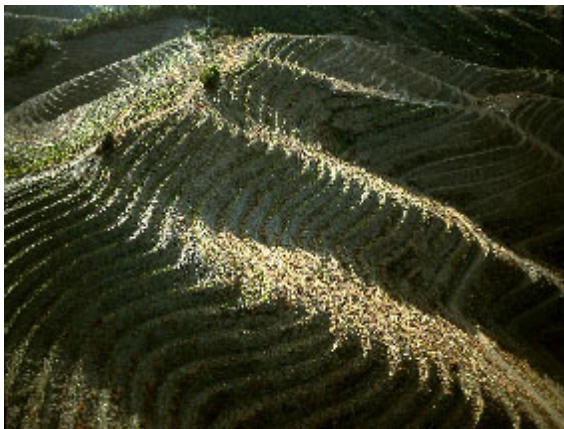
WE'LL VISIT OUR SPECTACULAR VINEYARD AND WINERY IN PRIORAT