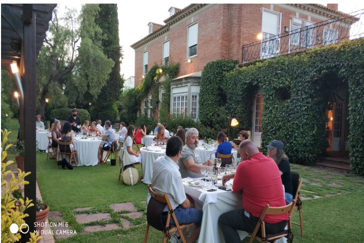
Marimar’s house in Sitges, the seaside resort south of Barcelona, is the perfect venue for a great party.

Sunday, June 12: Transportation from the airport to hotel in Sitges. Welcome party at the same hotel, located right on the beachfront.